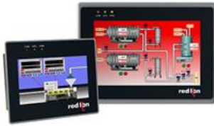
G3 Kadet HMIs

Note that the CR1000 product line also offers a 10" model, pictured below. All CR1000 HMIs are programmed using Crimson 3.1. Crimson 3.1 can automatically convert Crimson 3.0 databases created for G3 Kadet HMIs, recommend the closest alternative, and notify users of the likely changes that will occur when migrating from one to the other. Please refer to the Crimson 3.1 manual and thoroughly review the resulting database to ensure functionality meets expectations before proceeding.